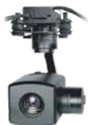
Security and surveillance camera with Pan Tilt Zoom