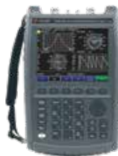
Telecommunication Spectrum Analyzer