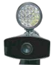
Spotlight Megaphone speaker